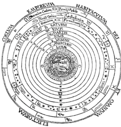
Schema huius præmissæ diuisionis Sphærarum .